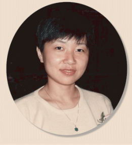
FENG YUN PROFESSIONAL 9 DAN

One of only two female 9 - dan professional go players in the world. Former women's world champion and national champion of China. Founder of the Feng Yun Go School. Mother of two girls.